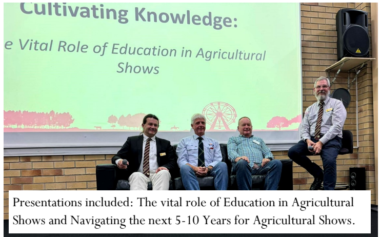
Presentations included: The vital role of Education in Agricultural Shows and Navigating the next 5-10 Years for Agricultural Shows.