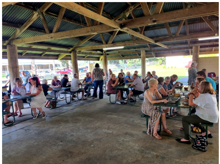
Above: Thanks to the volunteers who came to the feedback meeting and BBQ at The Branding Rail in December. It was great to share ideas over a few drinks and a meal. We appreciate your support.